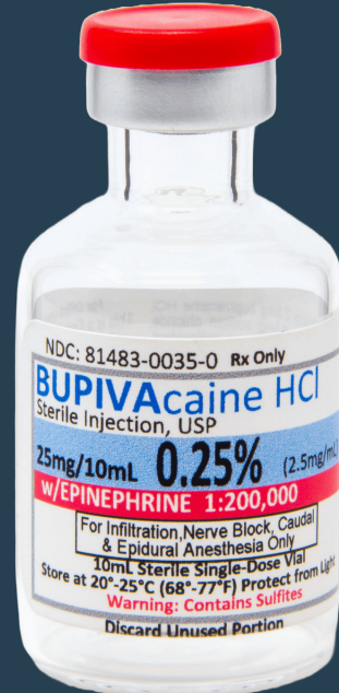
BUPIVACAINE EPI 0.25% SINGLE DOSE VIALS